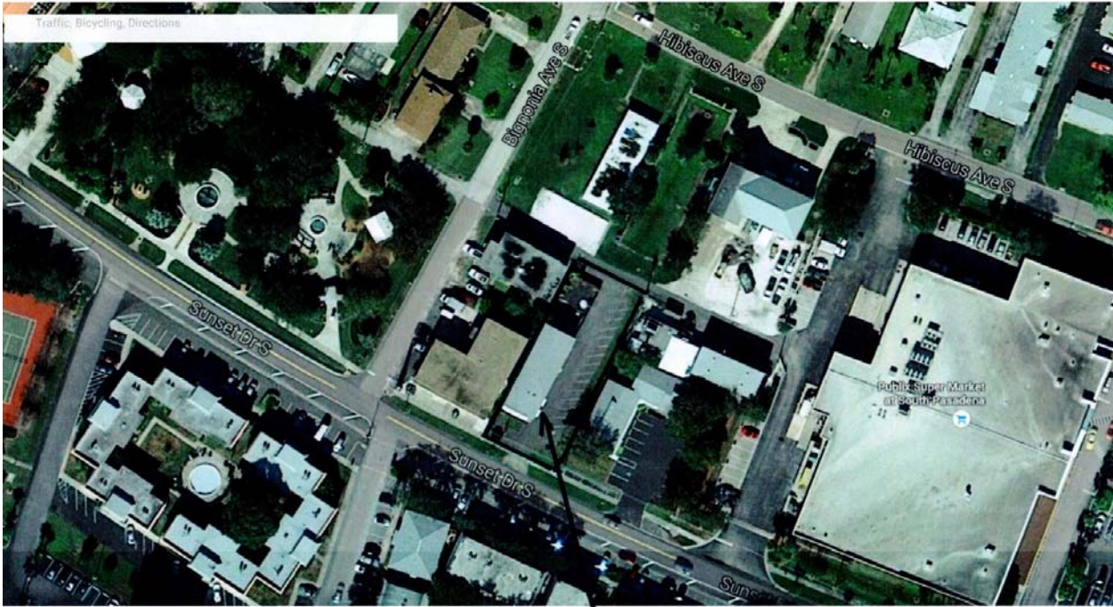
Subject Property 6981 Sunset Dr, South Pasadena